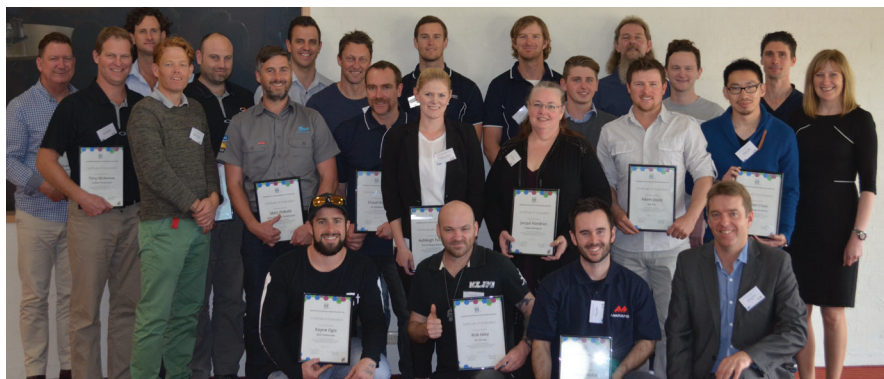
2016 Participants' Workshop Program

“ This program makes you sit back and think of what's really going on in the business. It helps to identify areas where you really can improve financially and increase productivity ”