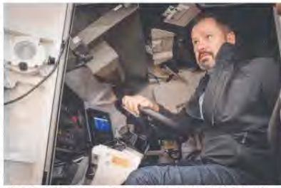
Industry Minister Ed Husic tries out one of Universal Motion Simulation's cabins at Deakin University.